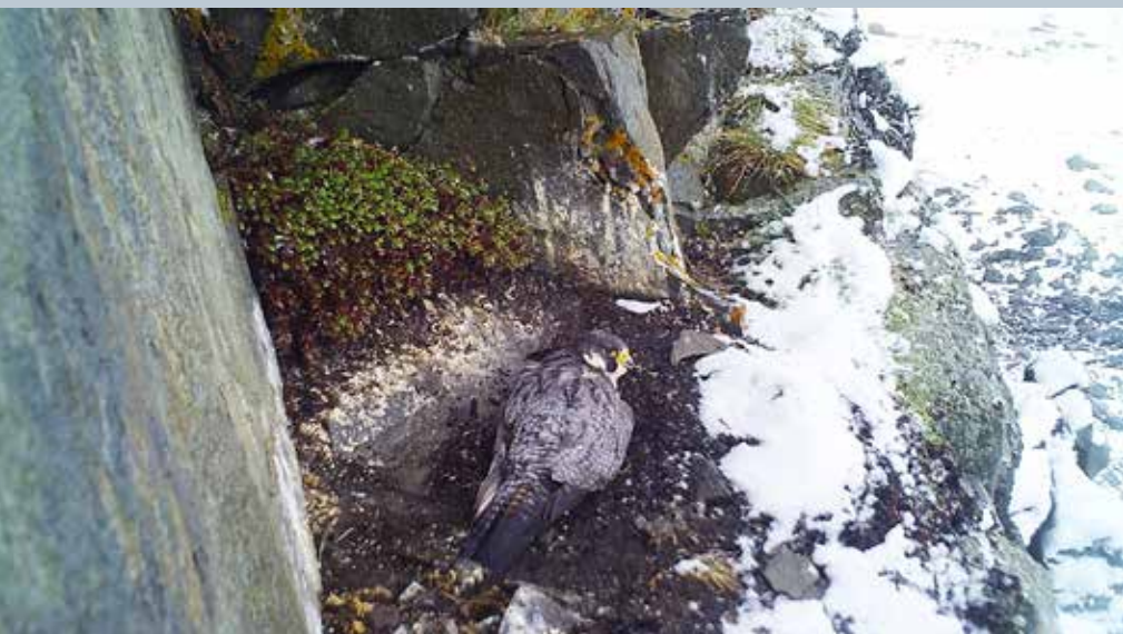
PHOTO SEQUENCE OF NESTING PEREGRINES IN THULE AREA.

TOP IMAGE: FEMALE SITTING EGGS WHILE THERE IS STILL SNOW AND ICE SURROUNDING HER.