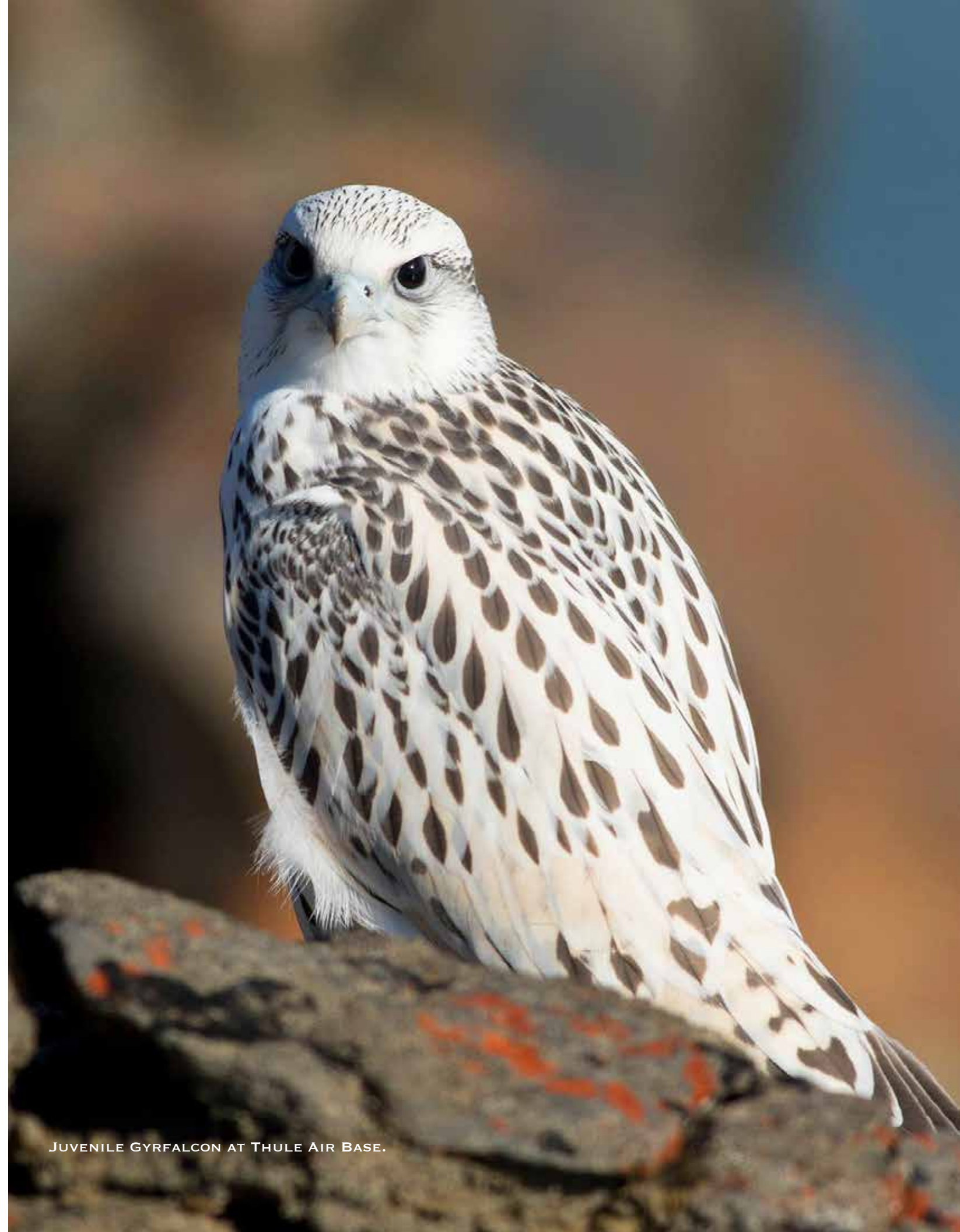
JUVENILE GYRFALCON AT THULE AIR BASE.

The High Arctic Institute's mission is to continue with the falcon research first started by Bill Mattox and my father in central-west and northwest (hereafter referred to as Thule) Greenland, respectively. Current research is primarily focused in the Thule area, with falcon surveys and research occurring on an annual basis. To better understand the diverse High Arctic ecosystem in the Thule area we have also expanded our research to include most all bird species occurring in the area, with an emphasis on species which are rare and occur at very low densities.